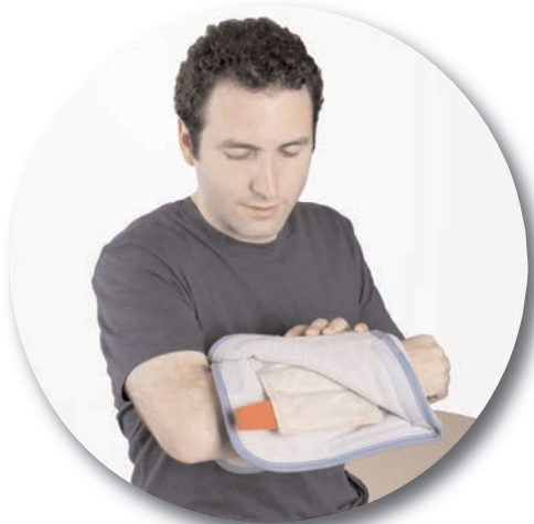
halfsize with terry cover shown in use