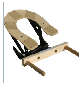
UP PPOS-B - Upgrade from Dual Action Face Rest Base to Pivot Posi-tilt. Full range of adjustment is 4-6" and pivots 30° in either direction.