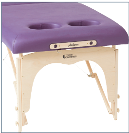
BR - Breast Recesses Option - Breast/Scapula Recesses include dual cutouts with central sternum/spine support (includes custom plugs)