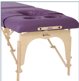
PG - Prenatal Option - Breast Recesses and belly cutout with adjustable sling to provide comfort and support to expectant mothers of any size (includes custom plugs)