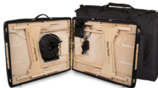
Complete Professional Package Includes Deluxe Adjustable Facecradle with FacePillow and durable carry case.