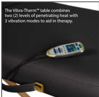
The Vibra-Therm™ table combines two (2) levels of penetrating heat with 3 vibration modes to aid in therapy.