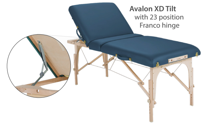
Avalon XD Tilt with 23 position Franco hinge